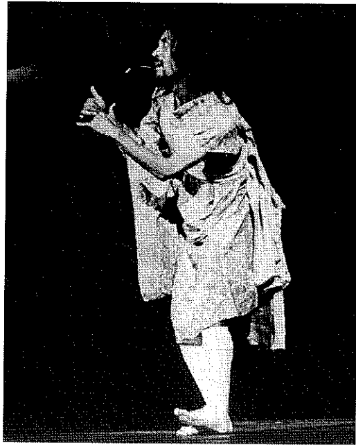
2 & 3 Hijikata Tatsumi to Nihonjin: Nikotai no hanran ( Hijikata Tatsumi and the Japanese: Rebellion of the Body, 1968), a solo choreographed by Hijikata Tatsumi at Nihon seinen kan Hall

where words are few. Yet many words are gradually becoming necessary, because this is a time when the body is required to put words into order. Dance undoubtedly has such an aspect to it, though of being created in a place where words are few.